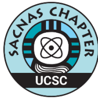
Secondary Custom Chapter Logo