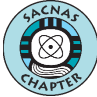
Secondary General Chapter Logo